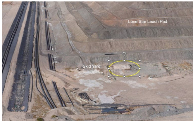
Lone Star Leach Pad "Skid Yard"