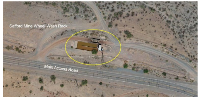
Safford Mine Wheel Wash