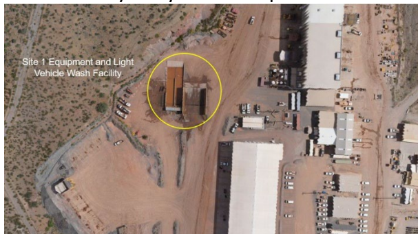
Heavy-Duty Truck Shop at Site 1