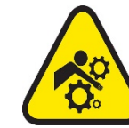
Exposure to Electrical Hazards