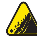
Hazardous Substance – Acute Exposure