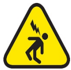
Fall from Heights