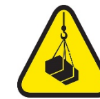
Uncontrolled Release of Energy