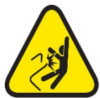
Vehicle Impact on Person