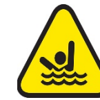
Entanglement and Crushing