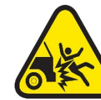
Vehicle Collision or Rollover