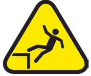
Fall from Height