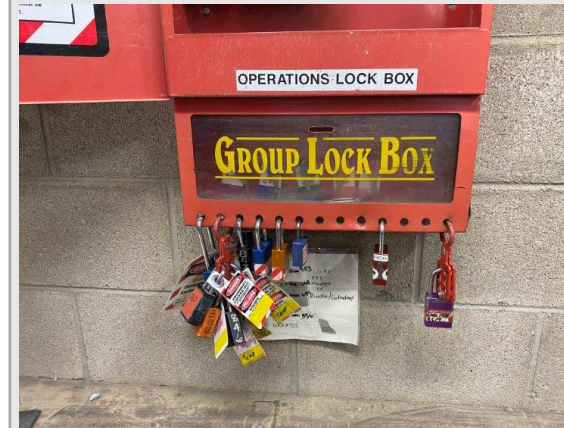
Operations lock box. Contractor was locked on this box without the ECC lock.