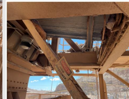
Spillage on edge of support beams over dribble chute on second level.