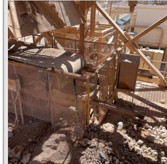
Area where rock fell.