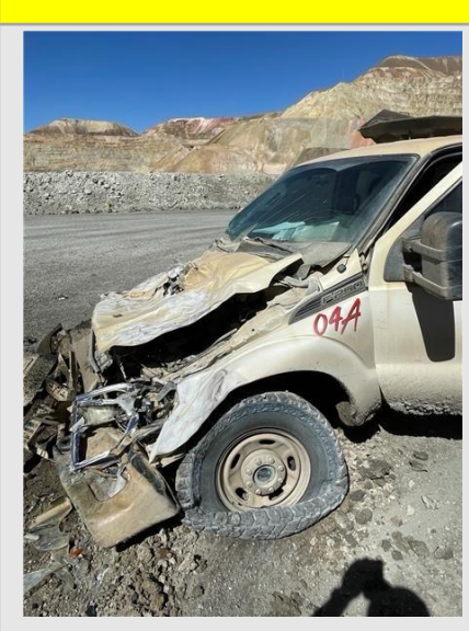
Pickup truck following incident