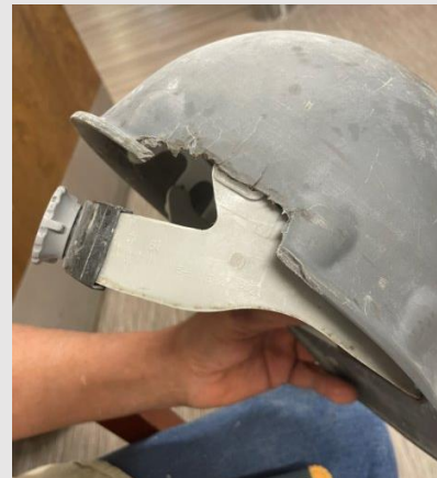
Employee's hard hat after impact.