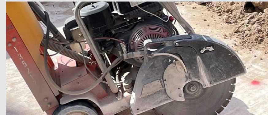
Saw used to make cut into concrete