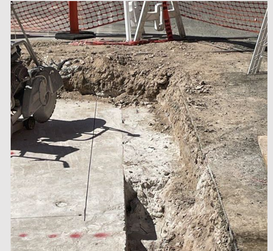
Excavation made outside of white paint