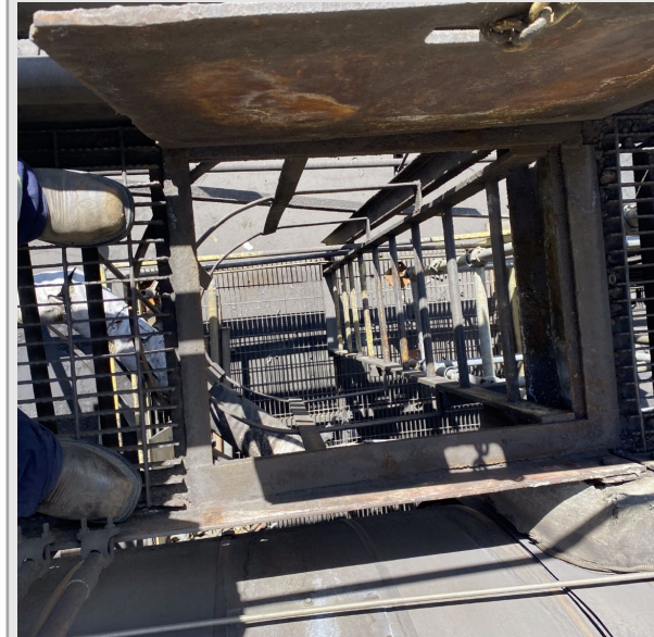
The open hatch the worker fell through and platform below (looking top down).