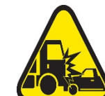
Vehicle Collision or Rollover