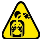
Hazardous Substance – Chronic Exposure