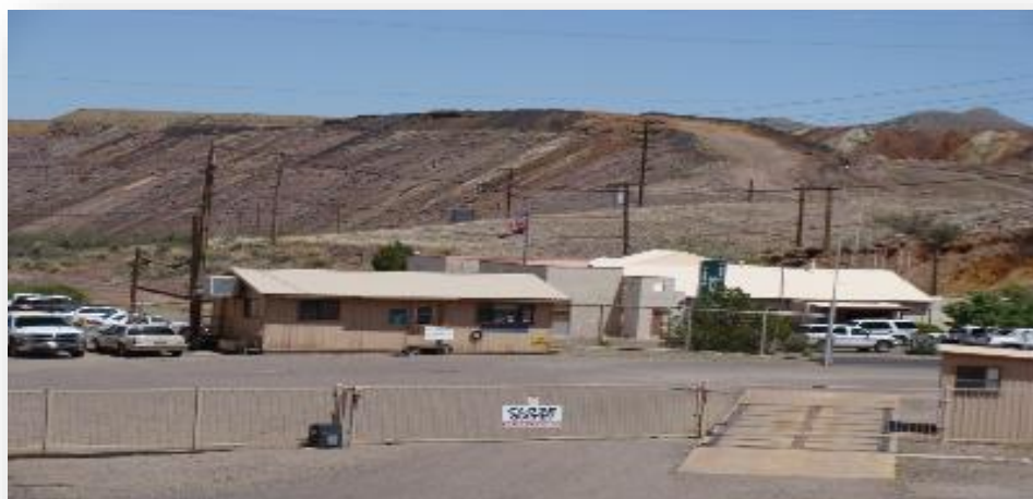
(9) MINE HORN BLASTS-REPORT TO GUARD SHACK AT MAIN GATE