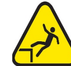
Fall from Heights