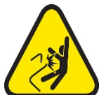
Uncontrolled Release of Energy