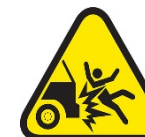
Vehicle Impact on Person