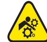
Entanglement and Crushing