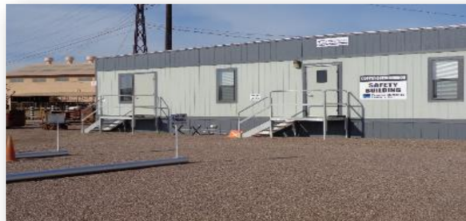
(5) MINE HORN BLASTS REPORT TO SAFETY BUILDING