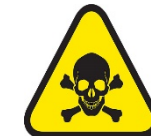
Hazardous Substance – Acute Exposure