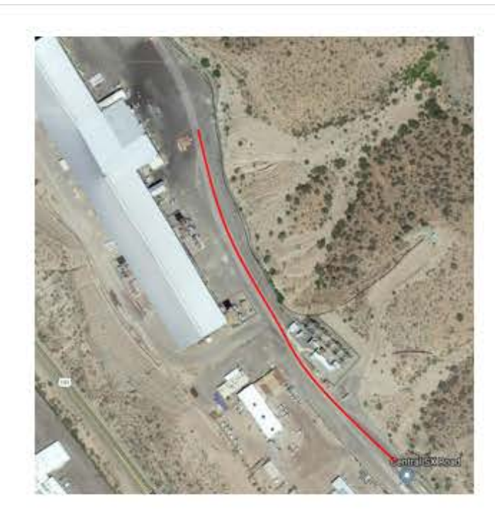
Stargo SX Central SX