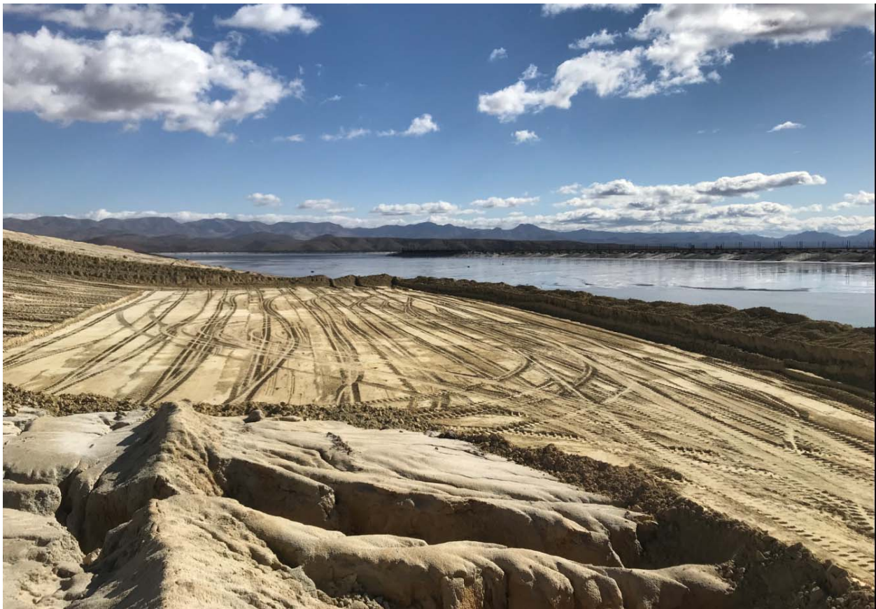
3) View of Concrete Dump Pad after Construction

Please reach out to the Environmental Department or Tailings Department with any questions.