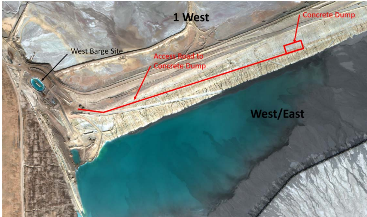
2) Aerial Image Showing Close-up View of Concrete Dump Area