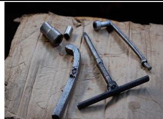
Non-Engineered Homemade or Modified Tools