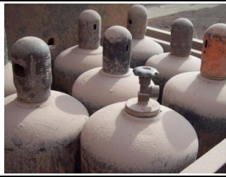
Improperly stored/secured compressed gas cylinder