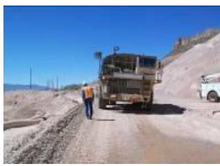
Missing or Inadequate Berm or Guardrail