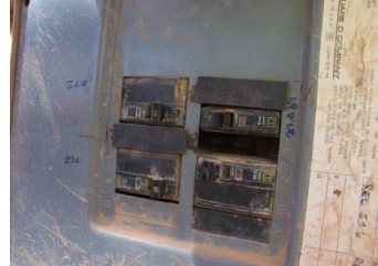
Unguarded Electrical Connections/Circuits