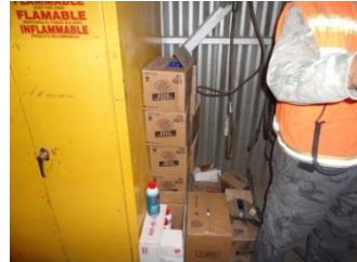
Improper Handling of Flammables and Combustibles