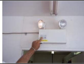
Damaged Emergency Lights/ Blocked Exits