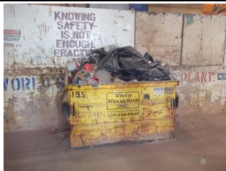
Waste Receptacles – No Lid / Eyewash not maintained