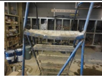
Damaged Hand railing, Toe Board, Work Platform