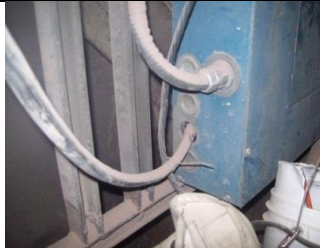
Improperly Bushed or protected electrical wires