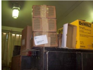
Improperly Stored Material