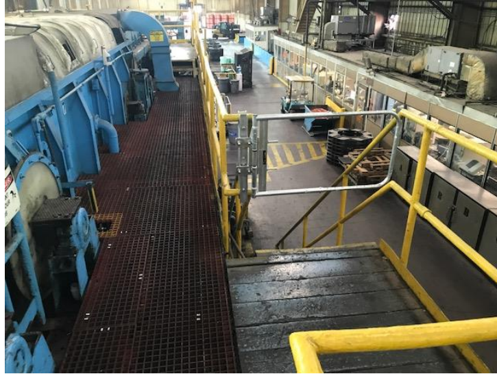
Newly Installed Stair Landing Gate

This is NOT an investigation report. It is a NOTIFICATION of a Significant advisory, event, occurrence, notice, regulatory action, or recall that requires immediate attention and action(s) at a Freeport-McMoRan operation and is being communicated to enhance safety awareness and information.