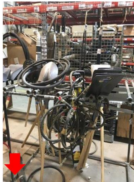
Picture 4: Box that fell impacted shovel rack and came to rest immediately below on floor.

This is NOT an investigation report. It is a NOTIFICATION of a Significant Incident that has taken place at a Freeport-McMoRan operation and is being communicated to enhance safety awareness should a similar situation exist. The information above is a preliminary assessment of the event and is not a formal investigation.