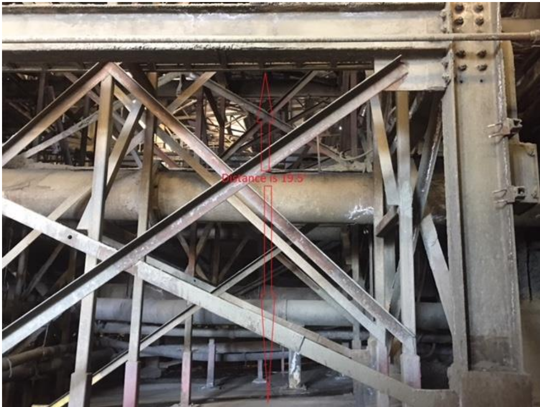
Picture 3: This depicts the distance below the walkway to ground level below.

This is NOT an investigation report. It is a NOTIFICATION of a Significant Incident that has taken place at a Freeport-McMoRan operation and is being communicated to enhance safety awareness should a similar situation exist. The information above is a preliminary assessment of the event and is not a formal investigation.