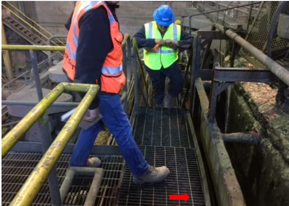
Picture 1: Demonstration photo only. This photo was taken after repairs were completed.